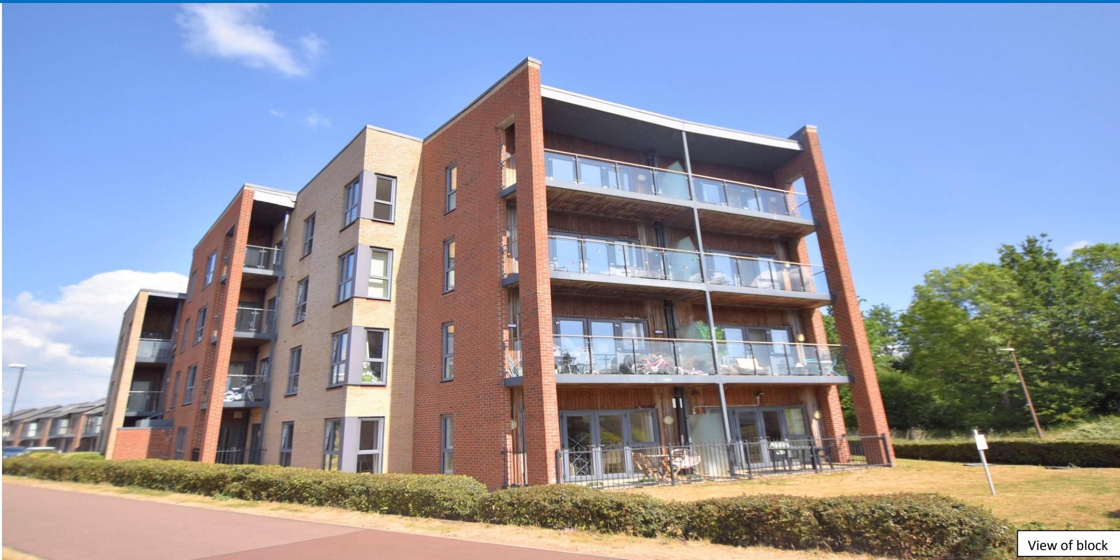
View of block